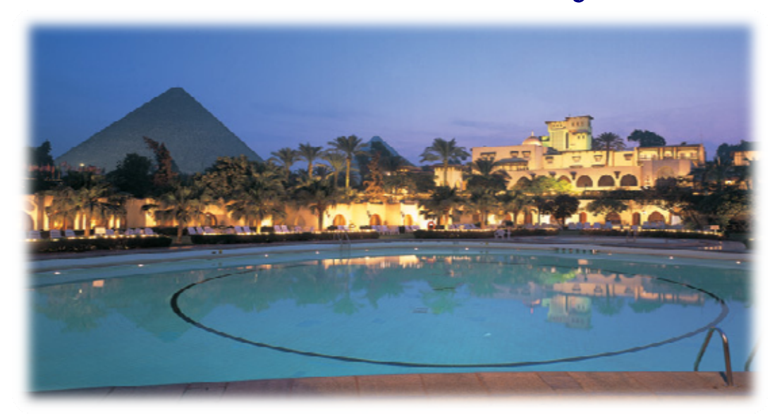
The Mena House. FIJET's home while in Cairo for the 54<sup>th</sup> World Congress

"I have found adventure in flying, in world travel, in business, and even close at hand... Adventure is a state of mind - and spirit." - Jacqueline Cochran (1910 - 1980)