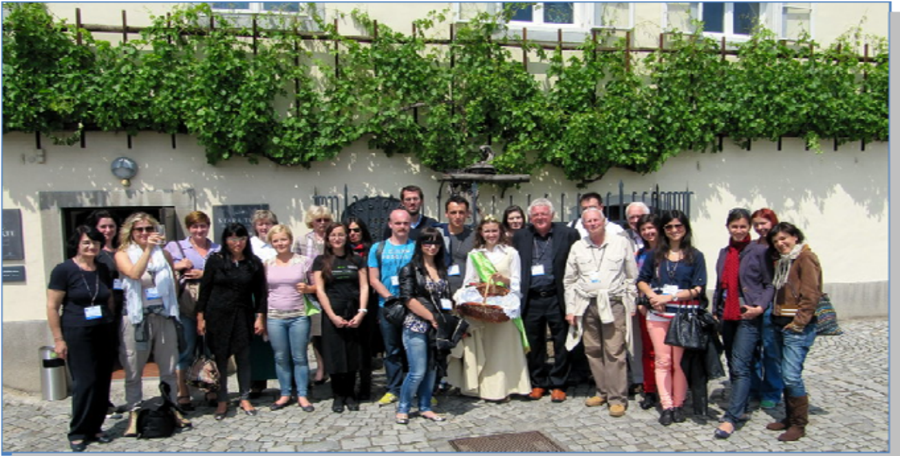
Participants in the Third Annual Young Journalists Academy in Maribor, Slovenia

“I have found adventure in flying, in world travel, in business, and even close at hand... Adventure is a state of mind - and spirit.” – Jacqueline Cochran (1910 - 1980)